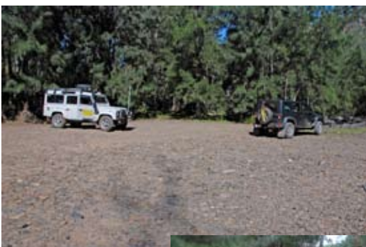
Dry Creek Crossing

The Deua River at the Dry Creek camp site had stopped flowing at the crossing to the Mericumbene FT. The water level is normally up to the front wheels of the Defender. Several goannas were spotted here. Burra Creek has stopped flowing and the Deua at Bendethera was down to a trickle last weekend.